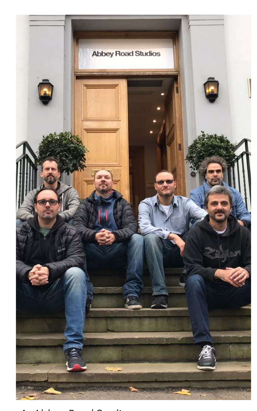
At Abbey Road Studios