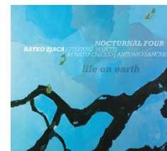
RATKO ZJACA NOCTURNAL FOUR LIFE ON EARTH IOR CD 77134-2