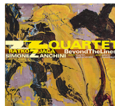
ZZ QUARTET BEYOND THE LINES IOR CD 77117-2