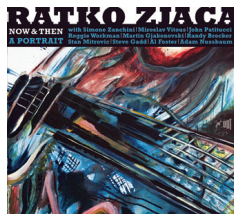
RATKO ZJACA NOW AND THEN IOR CD 77110-2